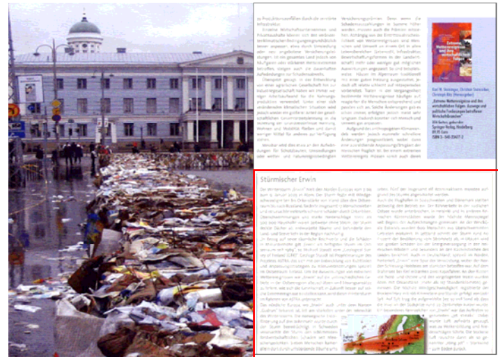
Info on ASTRA project , short article on Winterstorm, New German weather magazine, circulation: 40.000