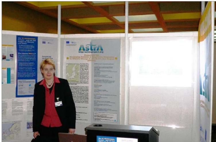
Booth at Extreme weather congress, Feb 16-17, 2006 400 experts as well as interested public